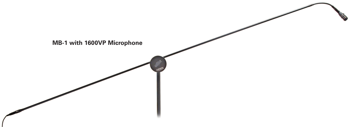
MB-1 with 1600VP Microphone